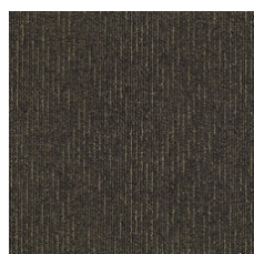
Black Chocolate 34751